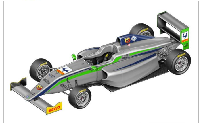
THE FIRST RASTER IMAGE OF THE TATUUS-ABARTH FORMULA 4 MOUNTING PIRELLI TYRES.